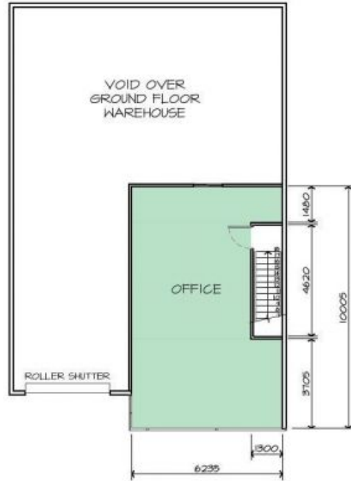
MEZZANINE FLOOR NLA 56.1m 2