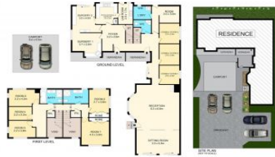
79 Cecil Avenue, Castle Hill Disclaimer: Measurements are approximate and are for illustrative purposes only. They are based on the floor plans provided. We make no guarantee, warranty or representation as to the accuracy and completeness of this floor plan.